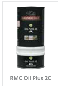
RMC Oil Plus 2C

Check the packaging and the safety data sheet for more details.