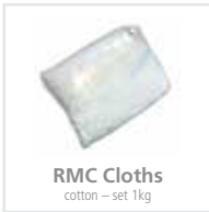
RMC Cloths cotton – set 1kg