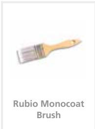
Rubio Monocoat Brush