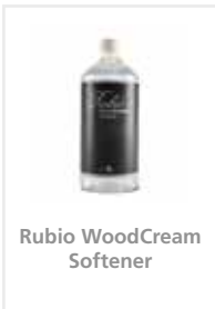
Rubio WoodCream Softener